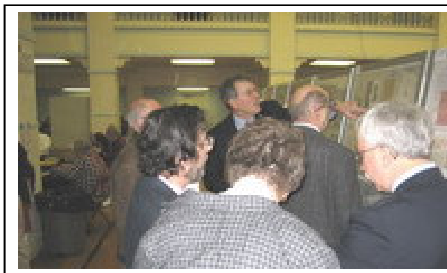
Our Judges at Work